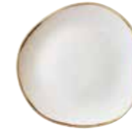
ORGANIC ROUND PLATE SWHSOG8 1 21cm 8 1 / 4 " SWHSOG7 1 18.6cm 7 3 / 8 " CTN QTY 12