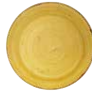
COUPE PLATE SMSSEVP61 16.5cm 6½" CTN QTY 12