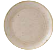
COUPE PLATE SNMSEVP61 16.5cm 6 1/2" CTN QTY 12