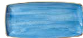
OBLONG PLATE SCFSOP111 29.5 x 15cm 11¾" x 6" CTN QTY 12