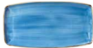
OBLONG PLATE SCFSOP141 35 x 18.5cm 14" x 7¼" CTN QTY 6