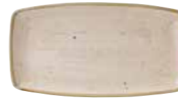
OBLONG PLATE SNMSOP111 29.5 x 15cm 11 3/4" x 6" CTN QTY 12