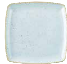
DEEP SQUARE PLATE SDESDS101 26.8cm 10 1/2" CTN QTY 6