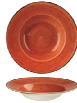
WIDE RIM BOWL SSOSVWBL1 28cm 11" 46.8cl 16.5oz CTN QTY 12 + SSOSVWBM1 24cm 9½" 28.4cl 10oz CTN QTY 12 +