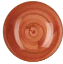
COUPE BOWL SSOSEVB91 24.8cm 9¾" 113.6cl 40oz CTN QTY 12 + SSOSEVB71 18.2cm 7¼" 42.6cl 15oz CTN QTY 12 +