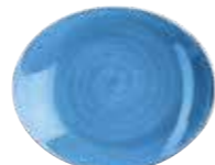
OVAL COUPE PLATE SCFSOP71 19.2cm 7¾" CTN QTY 12