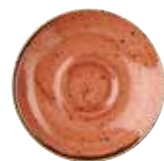
ESPRESSO SAUCER SSOSSESS1 11.8cm 4½" CTN QTY 12 + (Fits SSOSCEB91)