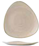
TRIANGLE PLATE SNMSTR71 19.2cm 7 1/2" CTN QTY 12