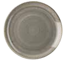
COUPE PLATE SPGSEVP81 21.7cm 8⅝" CTN QTY 12 + SPGSEVP61 16.5cm 6½" CTN QTY 12 +