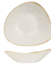
TRIANGLE BOWL SWHSTRB91 23.5cm 9 1 / 4 " 60cl 21oz SWHSTRB71 18.5cm 7 1 / 4 " 37cl 13oz SWHSTRB61 15.3cm 6" 26cl 9oz CTN QTY 12