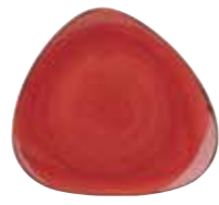
TRIANGLE PLATE SBRSTR71 19.2cm 7 1/4" CTN QTY 12