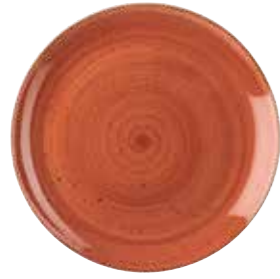
COUPE PLATE SSOSEV121 32.4cm 12¾" CTN QTY 6 + SSOSEV111 28.8cm 11¼" CTN QTY 12 + SSOSEV101 26cm 10¼" CTN QTY 12 +