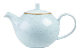
BEVERAGE POT SDESSB151 42.6cl 15oz H: 15cm CTN QTY 4 REPLACEMENT LID SDESRL151 CTN QTY 6