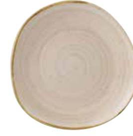
ORGANIC ROUND PLATE SNMSOG111 28.6cm 11 1/4" CTN QTY 12