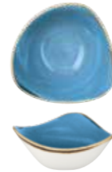
TRIANGLE BOWL SCFSTRB61 15.3cm 6" 26cl 9oz CTN QTY 12