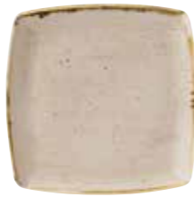
DEEP SQUARE PLATE SNMSDS101 26.8cm 10 1/2" CTN QTY 6