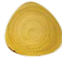
TRIANGLE PLATE SMSSTR7 1 19.2cm 7¾" CTN QTY 12