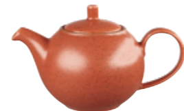
BEVERAGE POT SSOSSB151 42.6cl 15oz H: 15cm CTN QTY 4 REPLACEMENT LID SSOSRL151 CTN QTY 6