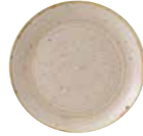
COUPE PLATE SNMSEVP81 21.7cm 8 1/2" CTN QTY 12