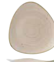
TRIANGLE PLATE SNMSTR91 22.9cm 9" CTN QTY 12