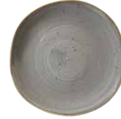
ORGANIC ROUND PLATE SPGSOG111 28.6cm 11¼" SPGSOG101 26.4cm 10⅝" SPGSOG81 21cm 8¼" SPGSOG71 18.6cm 7¼" CTN QTY 12