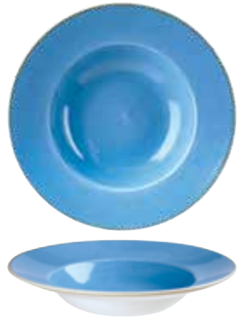
WIDE RIM BOWL SCFSVWBL1 28cm 11" 46.8cl 16.5oz CTN QTY 12