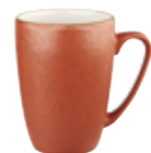
MUG SSOSVM121 34cl 12oz H: 11cm Dia: 8cm CTN QTY 12 +