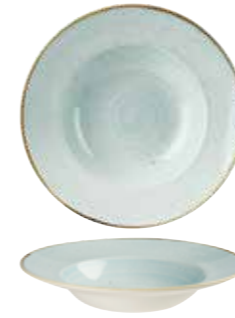
WIDE RIM BOWL SDESVWBL1 28cm 11" 46.8cl 16.5oz CTN QTY 12 + SDESVWBM1 24cm 9 1/2" 28.4cl 10oz CTN QTY 12 +