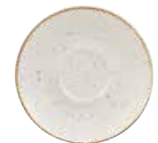
SAUCER SWHSCSS 1 15.6cm 6 1 / 4 " CTN QTY 12 + (Fits SWHSCB281, SWHSCB201 SWHSCB441 & SWHSCB401)