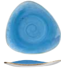
TRIANGLE PLATE SCFSTR91 22.9cm 9" SCFSTR71 19.2cm 7¾" CTN QTY 12