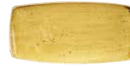
OBLONG PLATE SMSSOP111 29.5 x 15cm 11¾" x 6" CTN QTY 12