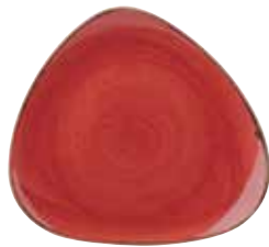
TRIANGLE PLATE SBRSTR121 31.1cm 12 1/4" CTN QTY 6