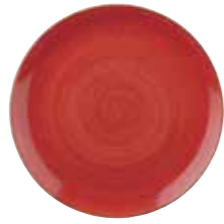
COUPE PLATE SBRSEV101 26cm 10 1/4" CTN QTY 12 +