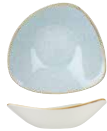
TRIANGLE BOWL SDESTRB91 23.5cm 9 1/4" 60cl 21oz SDESTRB71 18.5cm 7 1/4" 37cl 13oz SDESTRB61 15.3cm 6" 26cl 9oz CTN QTY 12