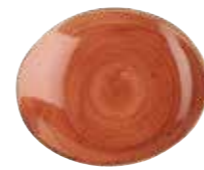
OVAL COUPE PLATE SSOSOP71 19.2cm 7¾" CTN QTY 12 +