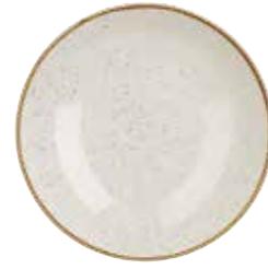
LARGE COUPE BOWL SWHSPLC21 31cm 12" 240cl 84.5oz CTN QTY 6 +