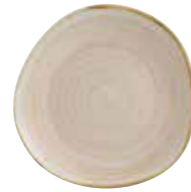
ORGANIC ROUND PLATE SNMSOG71 18.6cm 7 1/2" CTN QTY 12