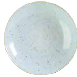
LARGE COUPE BOWL SDESPLC21 31cm 12" 240cl 84.5oz CTN QTY 6 +