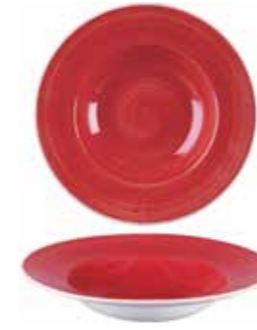
WIDE RIM BOWL SBRSVWBL1 28cm 11" 46.8cl 16.5oz CTN QTY 12 + SBRSVWBM1 24cm 9 1/2" 28.4cl 10oz CTN QTY 12 +