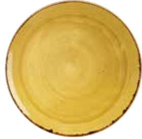
COUPE PLATE SMSSEV121 32.4cm 12¾" CTN QTY 6 SMSSEV111 28.8cm 11¼" CTN QTY 12