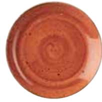
COUPE PLATE SSOSEVP81 21.7cm 8⅝" CTN QTY 12 + SSOSEVP61 16.5cm 6½" CTN QTY 12 +