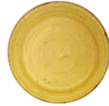
COUPE PLATE SMSSEVP81 21.7cm 8⅔" CTN QTY 12