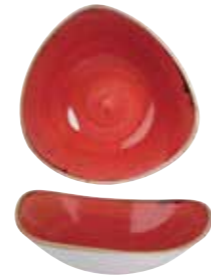
TRIANGLE BOWL SBRSTRB91 23.5cm 9 1/4" 60cl 21oz CTN QTY 12