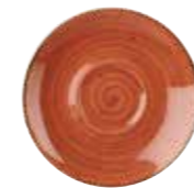
SAUCER SSOSSS1 15.6cm 6¼" CTN QTY 12 + (Fits SSOSCB281 & SSOSCB201)