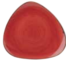
TRIANGLE PLATE SBRSTR91 22.9cm 9" CTN QTY 12