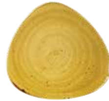
TRIANGLE PLATE SMSSTR9 1 22.9cm 9" CTN QTY 12