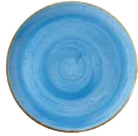
COUPE PLATE SCFSEV121 32.4cm 12¾" CTN QTY 6