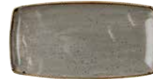
OBLONG PLATE SPGSOP141 35 x 18.5cm 14" x 7¼" CTN QTY 6 SPGSOP111 29.5 x 15cm 11¾" x 6" CTN QTY 12