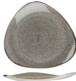
TRIANGLE PLATE SPGSTR121 31.1cm 12¼" CTN QTY 6 SPGSTR101 26.5cm 10½" CTN QTY 12 SPGSTR91 22.9cm 9" CTN QTY 12 SPGSTR71 19.2cm 7¾" CTN QTY 12