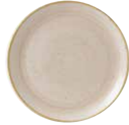
COUPE PLATE SNMSEV121 32.4cm 12 3/4" CTN QTY 6