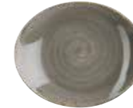
OVAL COUPE PLATE SPGSOP71 19.2cm 7¾" CTN QTY 12 +