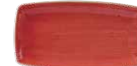
OBLONG PLATE SBR SOP111 29.5 x 15cm 11 1/4" x 6" CTN QTY 12