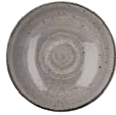
COUPE BOWL SPGSEVB91 24.8cm 9¾" 113.6cl 40oz CTN QTY 12 + SPGSEVB71 18.2cm 7¼" 42.6cl 15oz CTN QTY 12 +