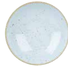
COUPE BOWL SDESEVB91 24.8cm 9 3/4" 113.6cl 40oz CTN QTY 12 + SDESEVB71 18.2cm 7 1/4" 42.6cl 15oz CTN QTY 12 +