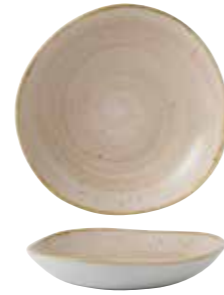
ORGANIC ROUND BOWL SNMSOGB11 25.3cm 9 7/8" 110cl 38oz CTN QTY 12