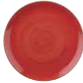
COUPE PLATE SBRSEVP61 16.5cm 6 1/2" CTN QTY 12 +