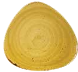
TRIANGLE PLATE SMSSTR121 31.1cm 12¼" CTN QTY 6