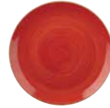
COUPE BOWL SBRSEVB91 24.8cm 9 3/4" 113.6cl 40oz CTN QTY 12 +