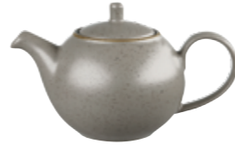
BEVERAGE POT SPGSSB151 42.6cl 15oz H: 15cm CTN QTY 4 REPLACEMENT LID SPGSRL151 CTN QTY 6