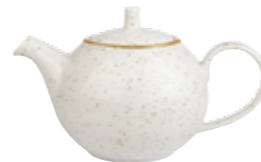
BEVERAGE POT SWHSSB151 42.6cl 15oz H: 15cm CTN QTY 4 REPLACEMENT LID SWHSRL151 CTN QTY 6