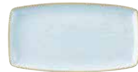
OBLONG PLATE SDESOP141 35 x 18.5cm 14" x 7 1/4" CTN QTY 6 SDESOP111 29.5 x 15cm 11 1/4" x 6" CTN QTY 12