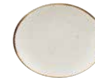
OVAL COUPE PLATE SWHSOP7 1 19.2cm 7 3 / 4 " CTN QTY 12 +