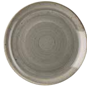
COUPE PLATE SPGSEV121 32.4cm 12¾" CTN QTY 6 + SPGSEV111 28.8cm 11¼" CTN QTY 12 + SPGSEV101 26cm 10¼" CTN QTY 12 +