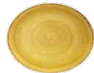
OVAL COUPE PLATE SMSSOP7 1 19.2cm 7¾" CTN QTY 12