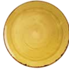
COUPE PLATE SMSSEV101 26cm 10¼" CTN QTY 12