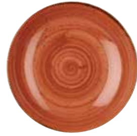
LARGE COUPE BOWL SSOSPLC21 31cm 12" 240cl 84.5oz CTN QTY 6 +