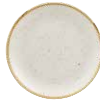
COUPE PLATE SWHSEVP81 21.7cm 8 2 / 3 " CTN QTY 12 + SWHSEVP61 16.5cm 6 1 / 2 " CTN QTY 12 +