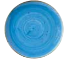
COUPE PLATE SCFSEVP81 21.7cm 8⅔" CTN QTY 12 SCFSEVP61 16.5cm 6½" CTN QTY 12