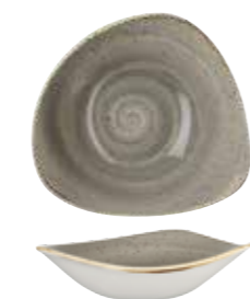
TRIANGLE BOWL SPGSTRB91 23.5cm 9¼" 60cl 21oz CTN QTY 12 SPGSTRB71 18.5cm 7¼" 37cl 13oz SPGSTRB61 15.3cm 6" 26cl 9oz CTN QTY 12