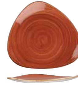
TRIANGLE PLATE SSOSTR121 31.1cm 12¼" CTN QTY 6 SSOSTR101 26.5cm 10½" CTN QTY 12 SSOSTR91 22.9cm 9" CTN QTY 12 SSOSTR71 19.2cm 7¾" CTN QTY 12