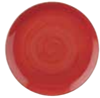
COUPE PLATE SBRSEVP81 21.7cm 8 2/3" CTN QTY 12 +