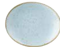
OVAL COUPE PLATE SDESOP7 1 19.2cm 7 3/4" CTN QTY 12 +