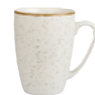
MUG SWHSSVM121 34cl 12oz H: 11cm Dia: 8cm CTN QTY 12 +