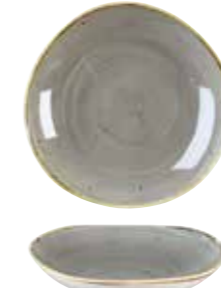
ORGANIC ROUND BOWL SPGSOGB11 18.6cm 7¼" CTN QTY 12