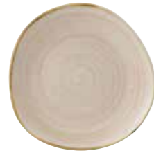
ORGANIC ROUND PLATE SNMSOG81 21cm 8 1/4" CTN QTY 12