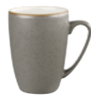
MUG SPGSVM121 34cl 12oz H: 11cm Dia: 8cm CTN QTY 12 +