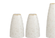
SALT SWHSSSA 1 7cm 2 1 / 2 " CTN QTY 12 PEPPER SWHSSPE 1 7cm 2 1 / 2 " CTN QTY 12 BUD VASE SWHSSBV 1 12.5cm 5" CTN QTY 6

+ Covered by Churchill 5 Year Edge Chip Warranty