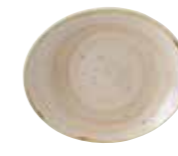
OVAL COUPE PLATE SNMSOP71 19.2cm 7 1/2" CTN QTY 12