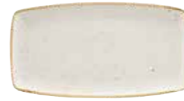
OBLONG PLATE SWHSOP141 35 x 18.5cm 14" x 7 1 / 4 " CTN QTY 6 SWHSOP111 29.5 x 15cm 11 3 / 4 " x 6" CTN QTY 12