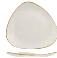
TRIANGLE PLATE SWHSTR9 1 22.9cm 9" CTN QTY 12 SWHSTR7 1 19.2cm 7 3 / 4 " CTN QTY 12