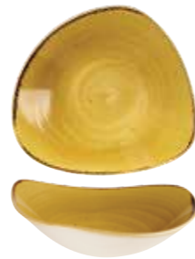
TRIANGLE BOWL SMSSTRB91 23.5cm 9¼" 60cl 21oz CTN QTY 12