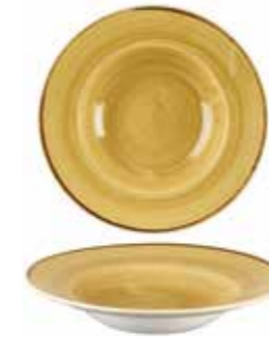
WIDE RIM BOWL SMSSVWBL1 28cm 11" 46.8cl 16.5oz CTN QTY 12 SMSSVWBM1 24cm 9½" 28.4cl 10oz CTN QTY 12