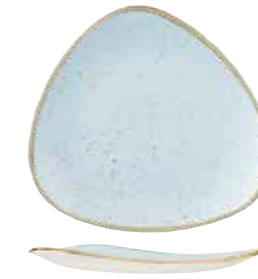
TRIANGLE PLATE SDESTR121 31.1cm 12 1/4" CTN QTY 6 SDESTR101 26.5cm 10 1/2" CTN QTY 12 SDESTR9 1 22.9cm 9" CTN QTY 12 SDESTR7 1 19.2cm 7 3/4" CTN QTY 12