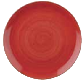
COUPE PLATE SBRSEV121 32.4cm 12 3/4" CTN QTY 6 + SBRSEV111 28.8cm 11 1/4" CTN QTY 12 +