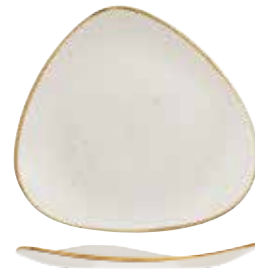
TRIANGLE PLATE SWHSTR121 31.1cm 12 1 / 4 " CTN QTY 6 SWHSTR101 26.5cm 10 1 / 2 " CTN QTY 12