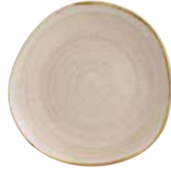
ORGANIC ROUND PLATE SNMSOG101 26.4cm 10 3/8" CTN QTY 12