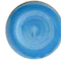
COUPE BOWL SCFSEVB71 18.2cm 7¼" 42.6cl 15oz CTN QTY 12