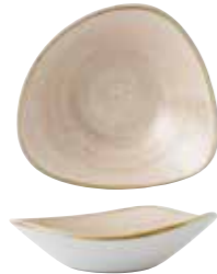
TRIANGLE BOWL SNMSTRB91 23.5cm 9 1/4" 60cl 21oz CTN QTY 12