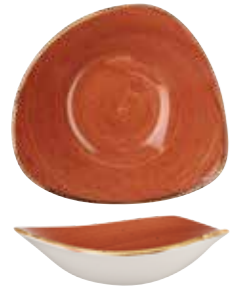
TRIANGLE BOWL SSOSTRB91 23.5cm 9¼" 60cl 21oz CTN QTY 12 SSOSTRB71 18.5cm 7¼" 37cl 13oz CTN QTY 12