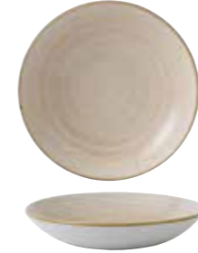
COUPE BOWL SNMSEVB91 24.8cm 9 3/4" 113.6cl 40oz CTN QTY 12