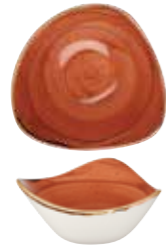
TRIANGLE BOWL SSOSTRB61 15.3cm 6" 26cl 9oz CTN QTY 12