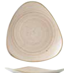
TRIANGLE PLATE SNMSTR121 31.1cm 12 1/4" CTN QTY 6