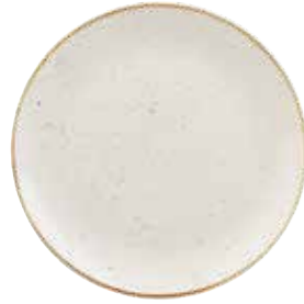
COUPE PLATE SWHSEV121 32.4cm 12 3 / 4 " CTN QTY 6 + SWHSEV111 28.8cm 11 1 / 4 " CTN QTY 12 + SWHSEV101 26cm 10 1 / 4 " CTN QTY 12 +