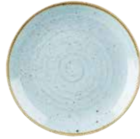
COUPE PLATE SDESEV121 32.4cm 12 3/4" CTN QTY 6 + SDESEV111 28.8cm 11 1/4" SDESEV101 26cm 10 1/4" CTN QTY 12 +