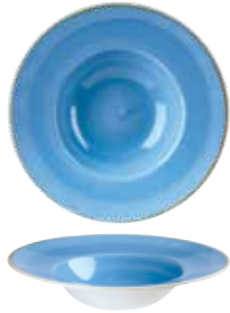
WIDE RIM BOWL SCFSVWBM1 24cm 9½" 28.4cl 10oz CTN QTY 12