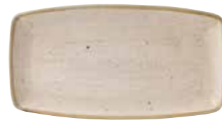
OBLONG PLATE SNMSOP141 35 x 18.5cm 14" x 7 1/4" CTN QTY 6