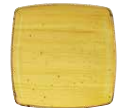
DEEP SQUARE PLATE SMSSDS101 26.8cm 10½" CTN QTY 6