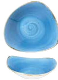
TRIANGLE BOWL SCFSTRB91 23.5cm 9¼" 60cl 21oz SCFSTRB71 18.5cm 7¼" 37cl 13oz CTN QTY 12