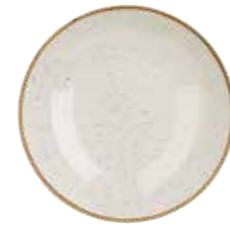
COUPE BOWL SWHSEVB91 24.8cm 9 3 / 4 " 113.6cl 40oz CTN QTY 12 + SWHSEVB71 18.2cm 7 1 / 4 " 42.6cl 15oz CTN QTY 12 +