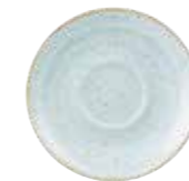
SAUCER SDESCSS 1 15.6cm 6 1/4" CTN QTY 12 + (Fits SDESCB441, SDESCB401 SDESCB281 & SDESCB201)