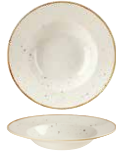
WIDE RIM BOWL SWHVVWBL1 28cm 11" 46.8cl 16.5oz CTN QTY 12 + SWHVVWBM1 24cm 9 1 / 2 " 28.4cl 10oz CTN QTY 12 +