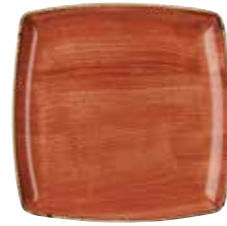
DEEP SQUARE PLATE SSOSDS101 26.8cm 10½" CTN QTY 6