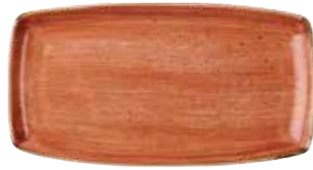
OBLONG PLATE SSOSOP141 35 x 18.5cm 14" x 7¼" CTN QTY 6 SSOSOP111 29.5 x 15cm 11¾" x 6" CTN QTY 12