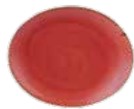
OVAL COUPE PLATE SBR SOP71 19.2cm 7 1/4" CTN QTY 12 +