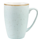
MUG SDESVM121 34cl 12oz H: 11cm Dia: 8cm CTN QTY 12 +