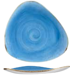
TRIANGLE PLATE SCFSTR121 31.1cm 12¼" CTN QTY 6 SCFSTR101 26.5cm 10½" CTN QTY 12