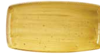
OBLONG PLATE SMSSOP141 35 x 18.5cm 14" x 7¼" CTN QTY 6