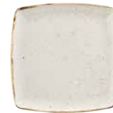
DEEP SQUARE PLATE SWHSDS101 26.8cm 10 1 / 2 " CTN QTY 6