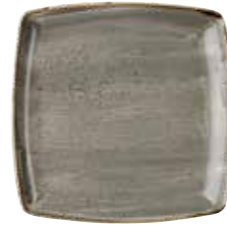
DEEP SQUARE PLATE SPGSDS101 26.8cm 10½" CTN QTY 6