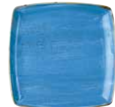
DEEP SQUARE PLATE SCFSDS101 26.8cm 10½" CTN QTY 6