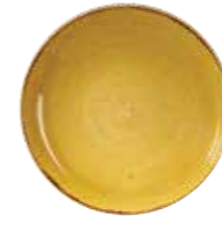
COUPE BOWL SMSSEVB91 24.8cm 9¾" 113.6cl 40oz CTN QTY 12