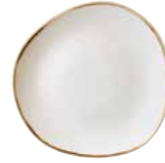
ORGANIC ROUND PLATE SWHSOG111 28.6cm 11 1 / 4 " SWHSOG101 26.4cm 10 3 / 8 " CTN QTY 12