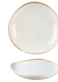
ORGANIC ROUND BOWL SWHSOGB11 25.3cm 9 3 / 4 " 110cl 38oz CTN QTY 12