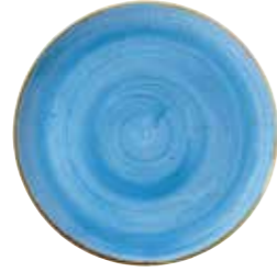
COUPE PLATE SCFSEV111 28.8cm 11¼" CTN QTY 12 SCFSEV101 26cm 10¼" CTN QTY 12