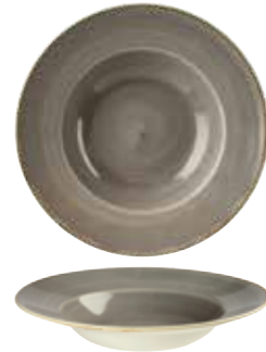
WIDE RIM BOWL SPGSVWBL1 28cm 11" 46.8cl 16.5oz CTN QTY 12 + SPGSVWBM1 24cm 9½" 28.4cl 10oz CTN QTY 12 +