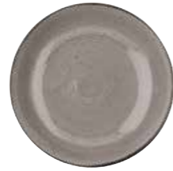
LARGE COUPE BOWL SPGSPLC21 31cm 12" 240cl 84.5oz CTN QTY 6 +