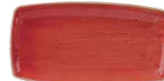
OBLONG PLATE SBR SOP141 35 x 18.5cm 14" x 7 1/4" CTN QTY 6