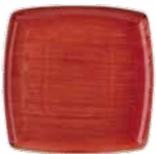
DEEP SQUARE PLATE SBRSDS101 26.8cm 10 1/2" CTN QTY 6