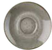
SAUCER SPGSCSS1 15.6cm 6¼" CTN QTY 12 + (Fits SPGSCB281 & SPGSCB201)