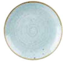
COUPE PLATE SDESEVP81 21.7cm 8 5/8" CTN QTY 12 + SDESEVP61 16.5cm 6 1/2" CTN QTY 12 +