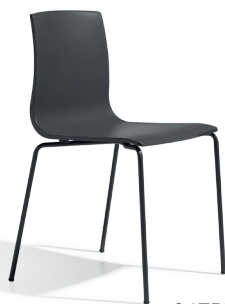
2675 VA 81

Scocca in tecnopolimero riciclabile. Struttura a 4 gambe in tubo d'acciaio \varnothing mm 16 zincato e verniciato per uso interno ed esterno. Impilabile.