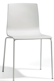
2675 VL 11