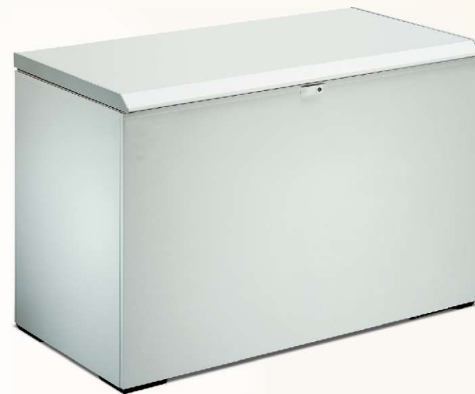
F 48 Chest Freezer