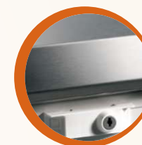
STAINLESS STEEL LID AVAILABLE*