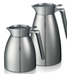
Oline stainless steel decanters

Bravilor Bonamat supplies various vacuum flasks that keep the temperature at its peak for a long time.