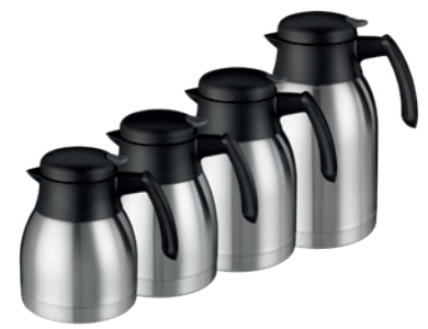
Double-walled vacuum flasks