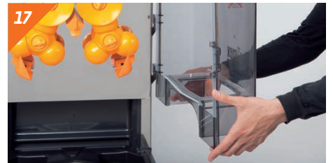
Put on the front cover.