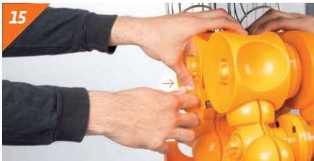
Put on the knife. Push until it clicks into place with a "click".