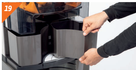
Place the peel buckets.