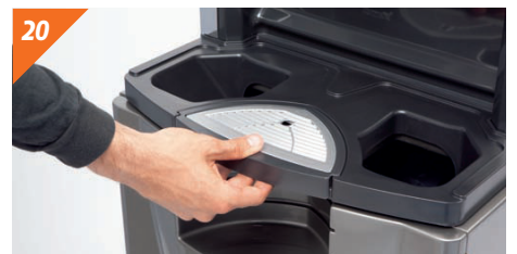
Place the glass holder tray and the filter.