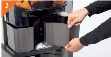
2 Take out the peel buckets.