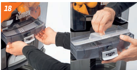
Insert the juice tray and the filter.