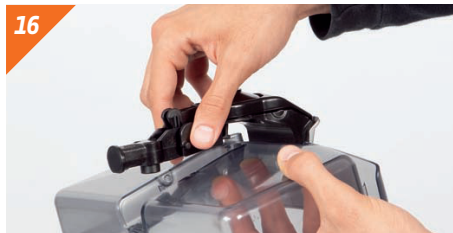
Mount the tap.