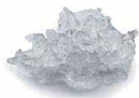
MF 37 Flake ice Residual water content 25%