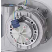
Gear box protection (hall effect)