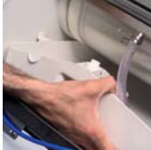
Easy to remove water sump