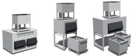
MAR 106+UBH2250 (sold separately) MAR 106+SIS700 (sold separately) MAR 106+SIS1350 (sold separately)

This product qualifies for the following listings: