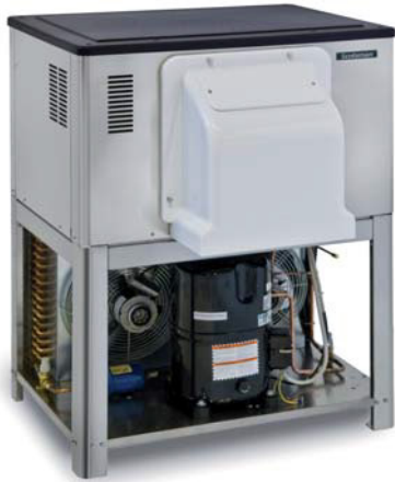
ABS Ice Chute Cover: sold separately.