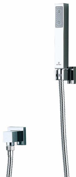
Immagine Prodotto - Product Image

Комплект лейка с фиксированным держателем, водорозеткой 1/2" M, и шлангом 150 см.