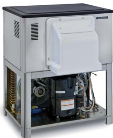
ABS Ice Chute Cover: sold separately.