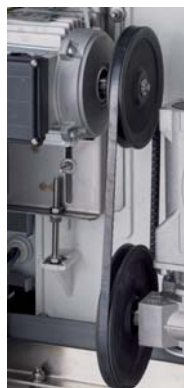
Pulleys & belt system allows to modify ice thickness