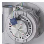
Gear box protection (hall effect)