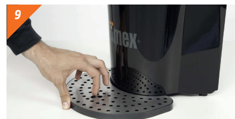
9 Remove coaster from coaster tray by inserting your index finger and pulling out gently.