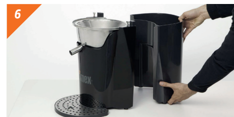
6 Remove waste container by pulling up horizontally.