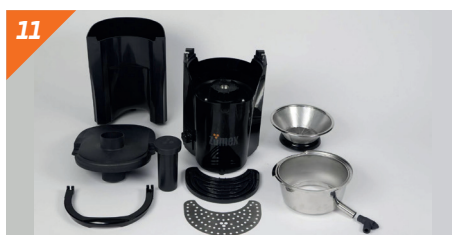
11 Clean parts.