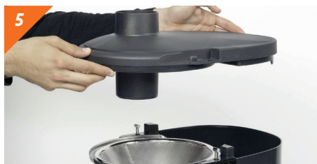
5 Remove top Multifruit lid by lifting upwards.