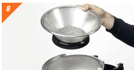
8 Separate filter from filter cover. ATTENTION! Do not touch the sharp points of the grater as they could cut you.