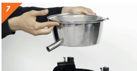
7 Disassemble grating filter and juice tank by pulling upwards.