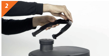
2 Remove security handle by positioning horizontally and pulling handle in the opposite direction.