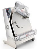
P-Roll 320/2 - P-Roll 420/2