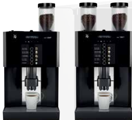
03.1210.0100 1 grinder

This flexibility makes it a joy to use. Whether it is used as additional equipment for a speciality machine, to make coffee for breakfast or to provide coffee for large meetings and many guests – the WMF 1200 F always dispenses outstanding filtered coffee.