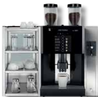
WMF 1200 F with additional equipment

Service A worldwide service network unique in the industry covering more than 70 countries ensures that you can always rely on your wmf coffee machine.