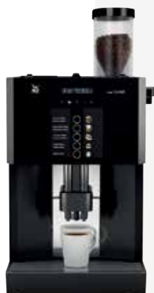
03.1210.0300 1 grinder, brewing arm on the right