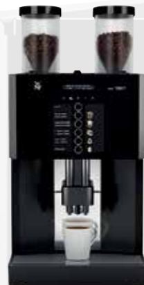
03.1210.0200 2 grinders