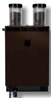
WMF 1200 F rear view