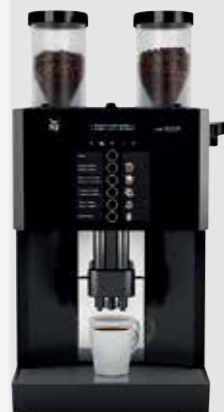
03.1210.0100 2 grinders, brewing arm on the right

Second coffee grinder for decaffeinated coffee ground from the whole bean, for example.