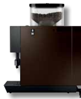
WMF 1200 F side view